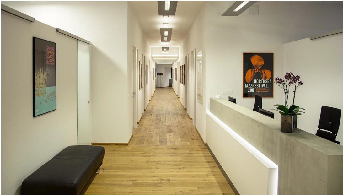
Caption 1: MVZ für Gefäßmedizin und Venenchirurgie Köln – entrance area.