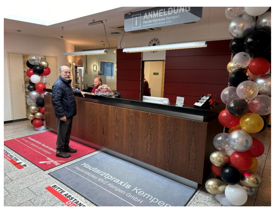
Caption 1: Hautärztliches MVZ Kempen GmbH – reception.